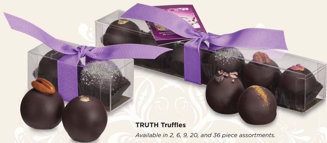
TRUTH Truffles Available in 2, 6, 9, 20, and 36 piece assortments.

The sensory pleasure of Sacred Chocolate bars and truffles reflects our commitment to using only premium raw and organic ingredients sourced locally and globally.